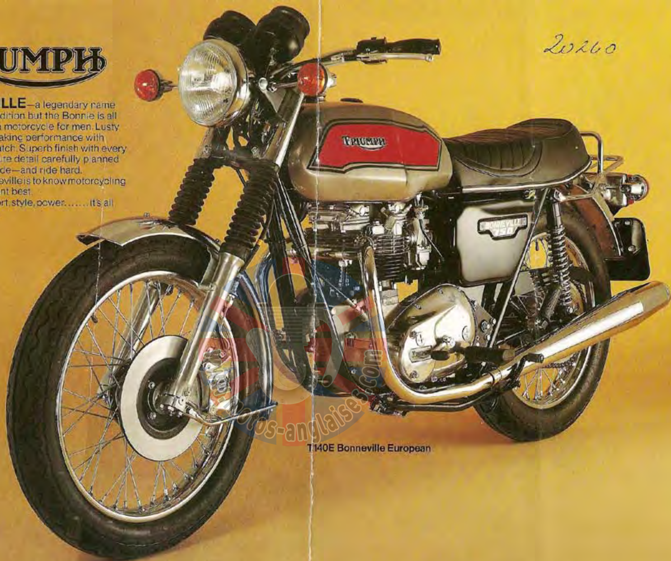
T140E Bonneville European