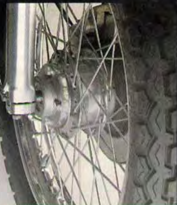
Polished and lacquered wheel hubs.