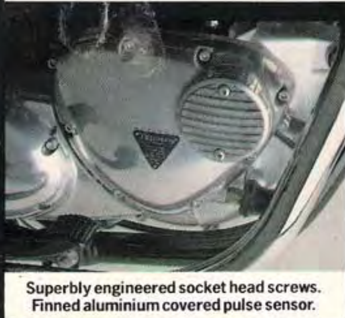
Superbly engineered socket head screws. Finned aluminium covered pulse sensor.