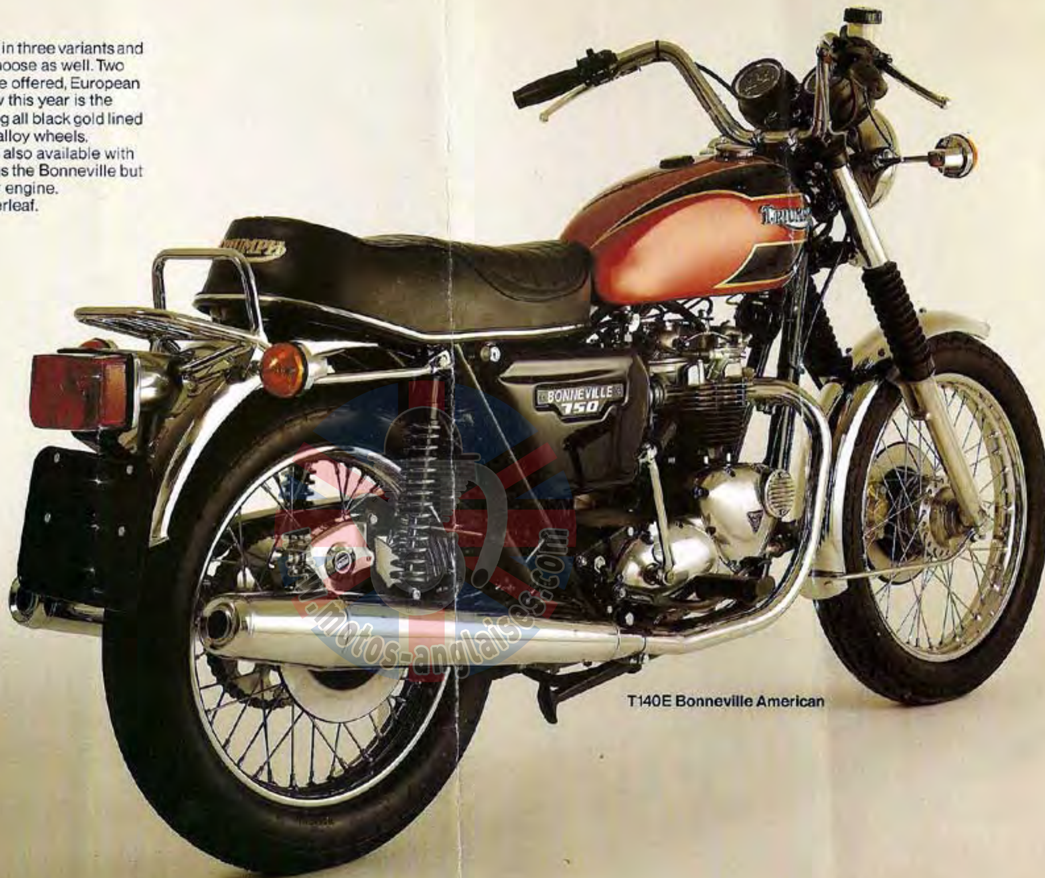
T140E Bonneville American

The Bonneville comes in three variants and there are colours to choose as well. Two basic specifications are offered, European and American and new this year is the 'Special' with its striking all black gold lined finish and Lester cast alloy wheels. The TR7V Tiger 750 is also available with general specification as the Bonneville but with single carburettor engine. For full details see overleaf.