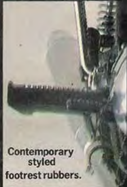
Contemporary styled footrest rubbers.