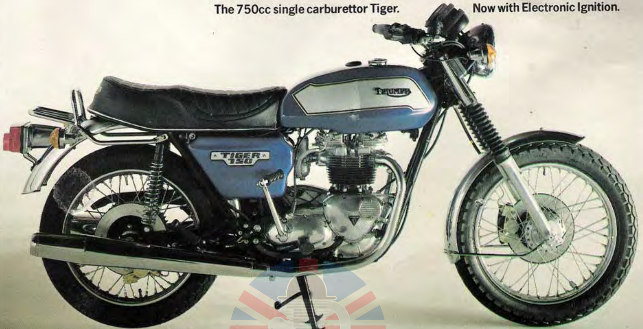
Now with Electronic Ignition.