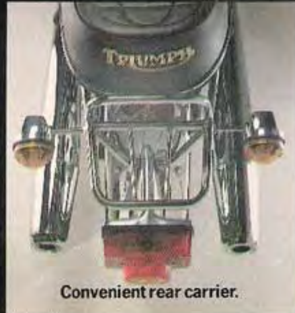
Convenient rear carrier.